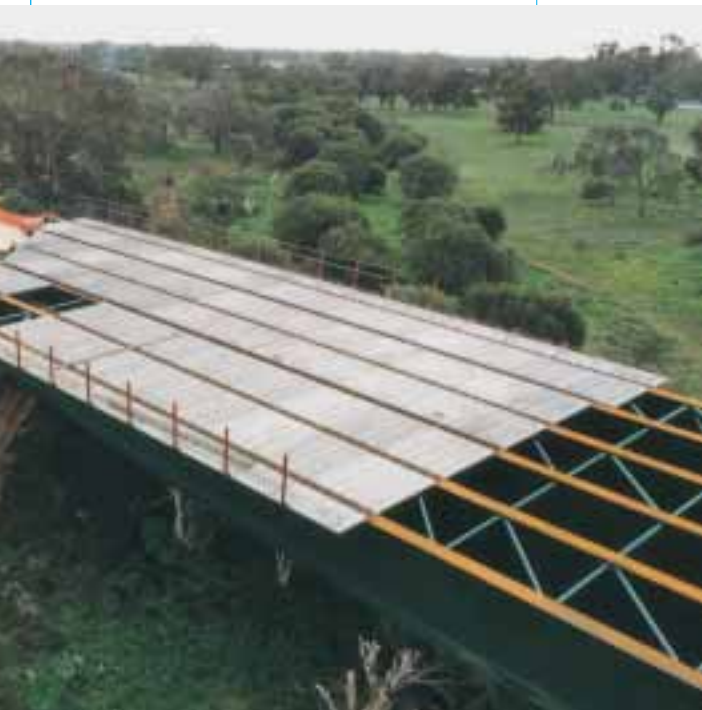
Opposite, top: The 56 metre span leaves an Aboriginal sacred site undisturbed.