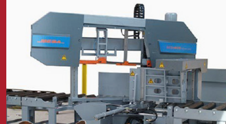
Meba Automatic Bandsaw

Customer benefits: High speed and low cost production accuracy.