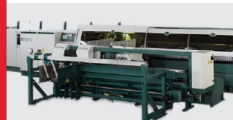
Adige Cold Saw

*Refer to your local Branch or Account Manager for more specific details and tolerances.