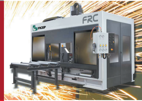
FICEP Robotic Plasma Oxy Coper

Customer benefits: Speeds up customer production time which increases productivity.