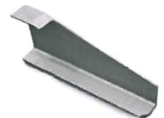
Acute angle mitres